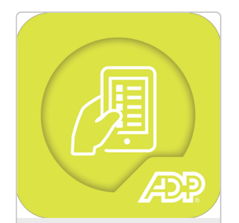
ADP ADP® Mobile Solutions