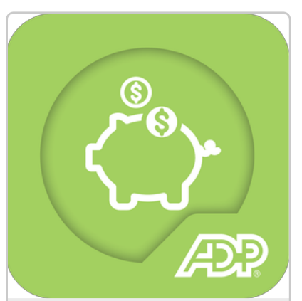
ADP ADP® Retirement Services