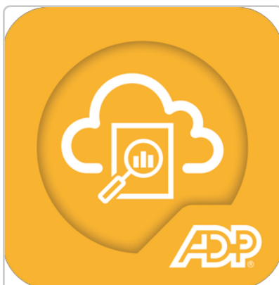
ADP Analytics, powered by ADP® DataCloud