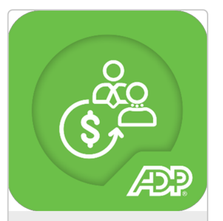
ADP ALINE Pay by ADP ®