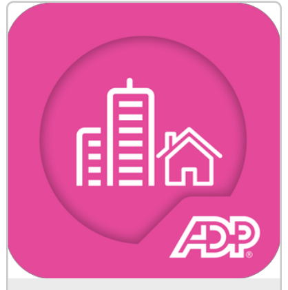
ADP Property & Casualty Insurance